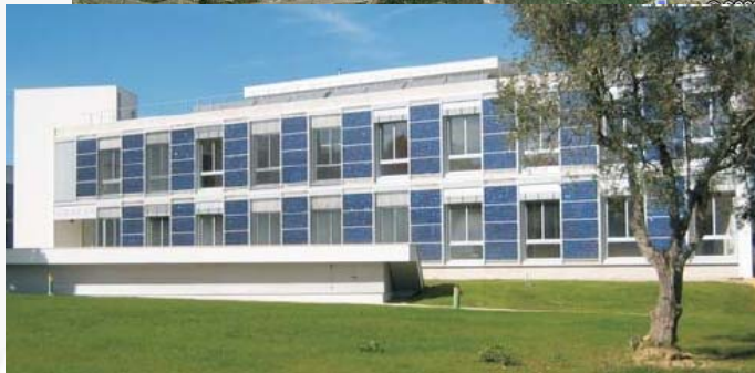
Solar XXI Building